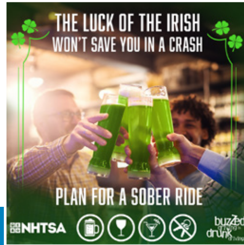
Social Post 1200x1200

On the left are two sample social media graphics: one for social stories on Instagram and Facebook and one for social feed posts that can be used on any platform.