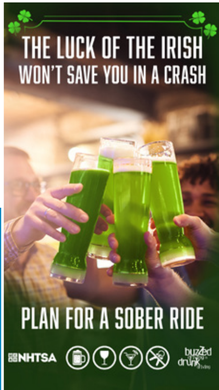
Social Story 1080x1920

This section contains shareable social media content for the St. Patrick's Day campaign. Provided on pages (13-14) are downloadable graphics with accompanying suggested posts that you can use or use as inspiration when sharing on your social media channels.