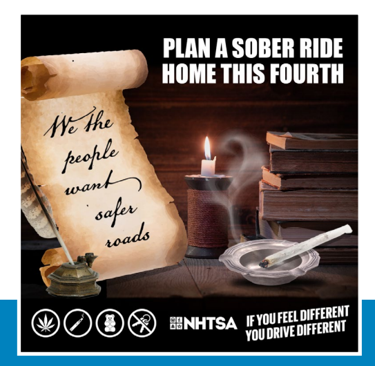
Social Post 1200x1200